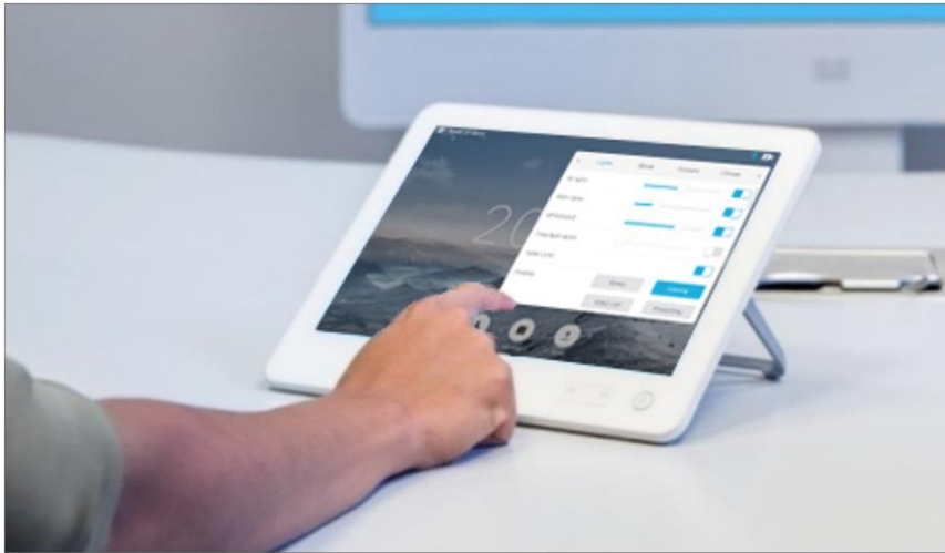
Figure 2. User Interface Displaying Room Control Information

Table 1 gives specifications of the Cisco TelePresence Touch devices.