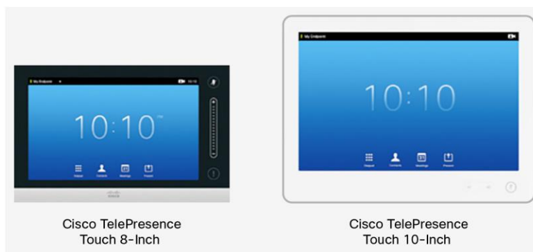
Figure 1. Cisco TelePresence Touch 8 and 10 Devices

With Cisco TelePresence Touch devices, you can quickly and easily access the most common tasks in the context of your meeting. The innovative design allows effortless integration with the various forms of synchronous and asynchronous communication that are already part of the workflow.