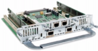
Figure 1. NM-HDV2-2T1/E1 with a 2-Port FXS VIC

Cisco IP Communications solutions provide the means for integrating voice and data allowing users to take advantage of services such as IP telephony, integrated services, and toll-bypass. These solutions allow enterprises, managed network service providers, and service providers to reap the advantages of IP telephony such as lower operating costs and increased productivity. Cisco IP Communications solutions also enable packet voice technologies including voice over IP (VoIP) (including H.323, Media Gateway Control Protocol (MGCP), and Sessions Initiation Protocol (SIP), voice over Frame, voice over ATM (including AAL2 and AAL5 adaptation layers).