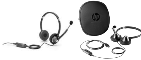
HP UC Wired Headset