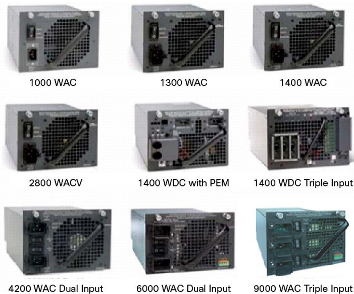
Figure 2. Cisco Catalyst 4500 Series Power Supplies

In any deployment scenario, whether AC or DC, the Cisco Catalyst 4500 Series has the power supplies and external power devices to meet customers' power needs for data, voice, and video applications (Figure 2).